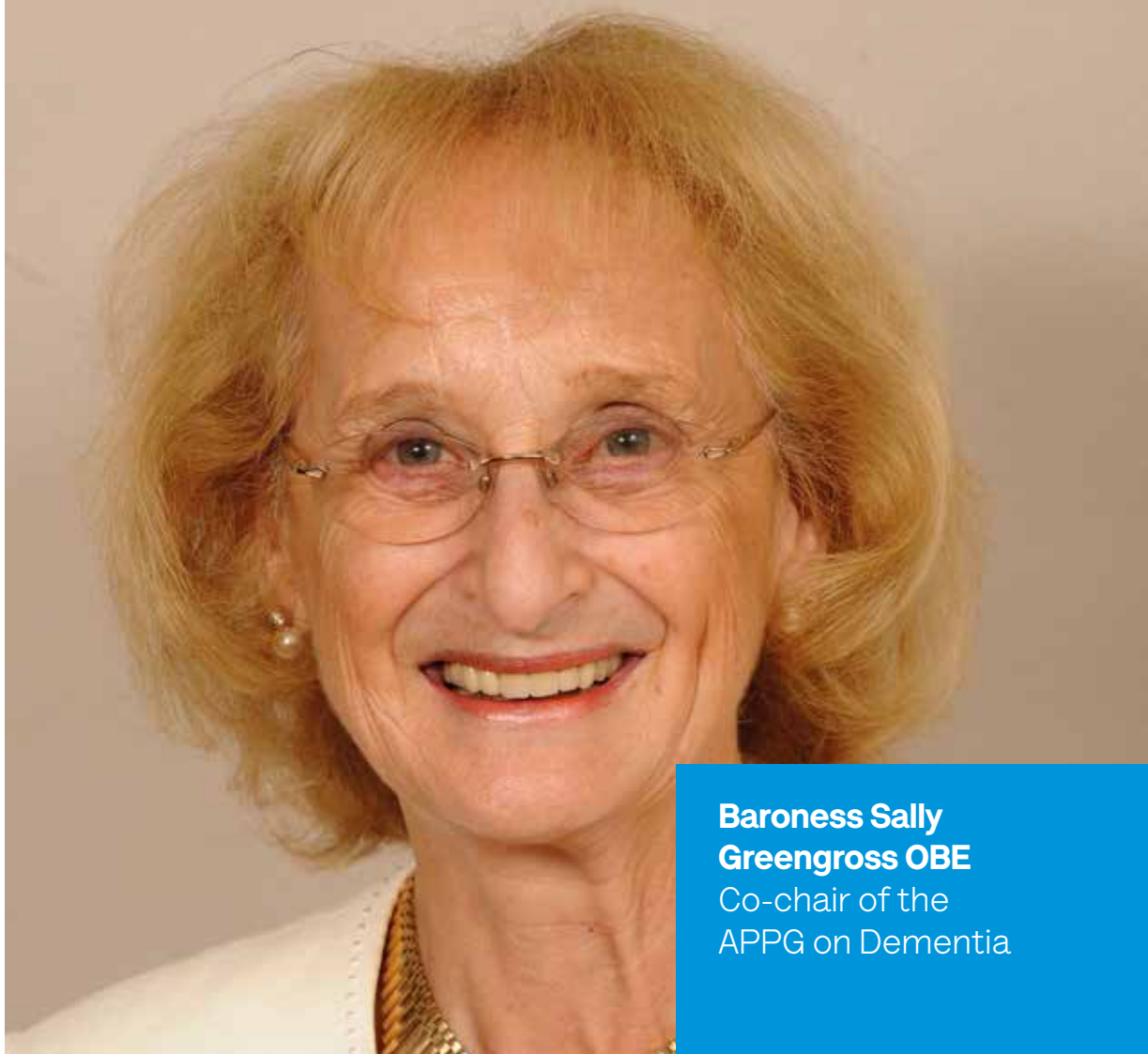
Baroness Sally Greengross OBE Co-chair of the APPG on Dementia