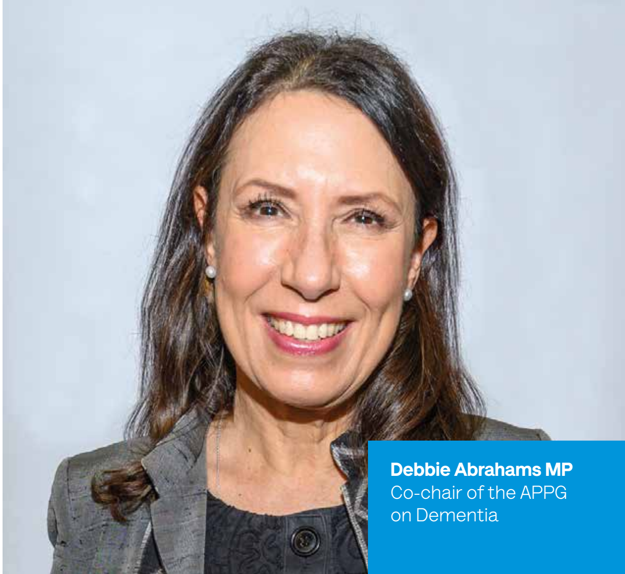
Debbie Abrahams MP Co-chair of the APPG on Dementia