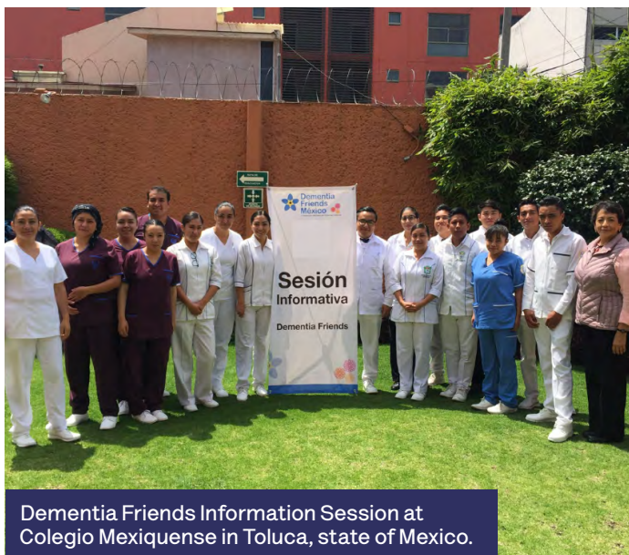
Dementia Friends Information Session at Colegio Mexiquense in Toluca, state of Mexico.

Young people have been instrumental in growing the dementia-friendly movement in Mexico and many of them have influenced their professors who have let them run shorter Dementia Friends sessions during lectures.