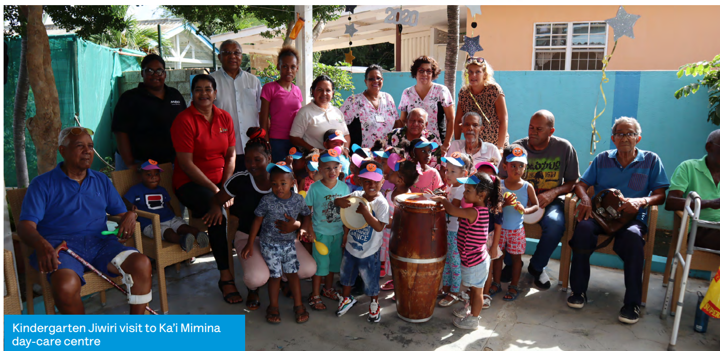
Kindergarten Jiwiri visit to Ka'i Mimina day-care centre