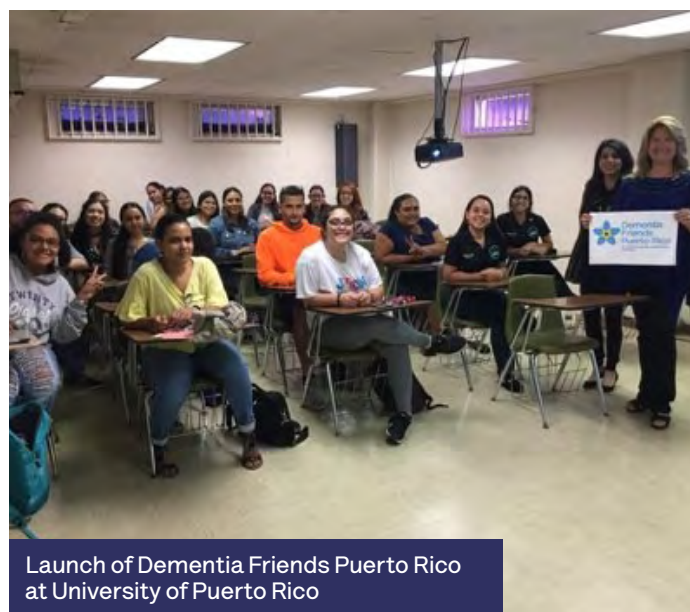
Launch of Dementia Friends Puerto Rico at University of Puerto Rico

'This is incredible, it is so good that Dementia Friends exists, and that people are having an impact on a whole society with such important knowledge about a condition that every day more people are developing. I think that Dementia Friends will be of great benefit to the students of the University of Puerto Rico in Cayey.'